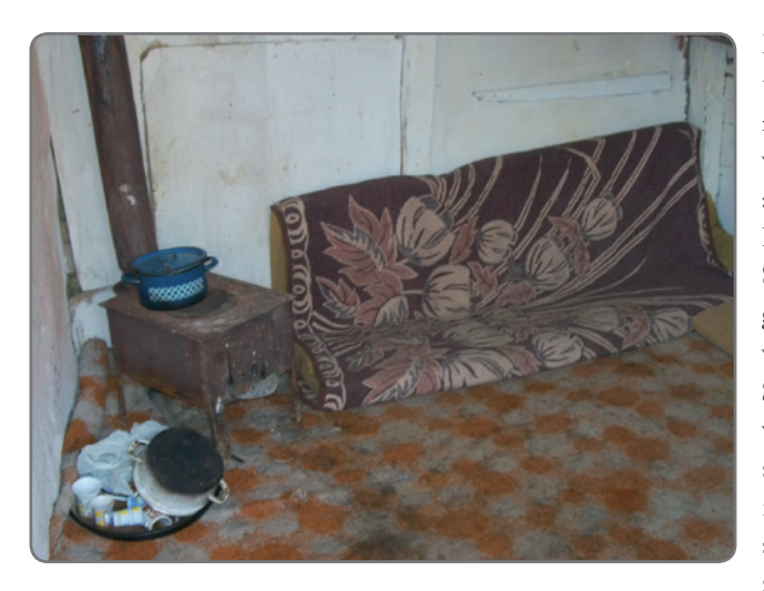
In Veles, Macedonia, Roma live in highly substandard conditions without proper heating or other utilities.

Many Roma are unable to access adequate housing because it is not affordable for them. The CESCR states that the "Personal or household financial costs associated with housing should be at such a level that the attainment and satisfaction of other basic needs are not threatened or compromised. [...] State parties should establish housing subsidies for those unable to obtain affordable housing." The right to adequate housing is not fulfilled if the costs are so high that individuals cannot access housing or if paying for housing renders them unable to afford to fulfill other basic human needs such as food. Moreover, affordability of housing refers to both the cost of the housing itself (i.e. rent) and the cost of services which are essential to adequate housing, like electricity and water.