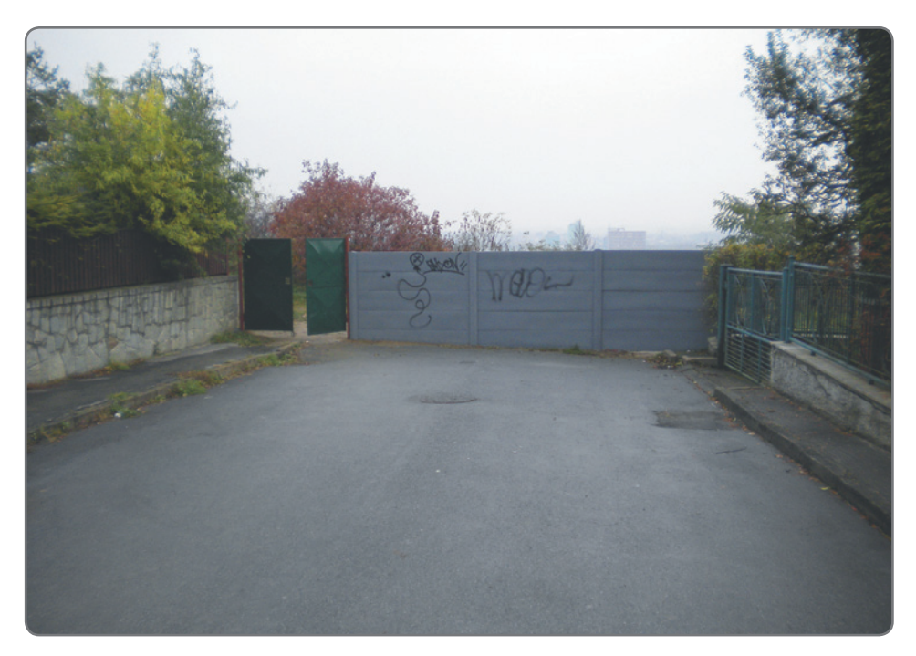
In reaction to complaints by non-Romani neighbours of Prešov's segregated Stará Tehel'ňa Romani ghetto, authorities erected a wall in September 2010 to prevent Roma from walking through the non-Romani neighbourhood.

The municipalities of Lomnička and Trebišov also built walls to "protect" non-Roma from Roma.<sup>41</sup> Most recently a wall has been built in Prešov<sup>42</sup> near the Romani neighbourhood Stará Teheľňa which was built only some ten years ago and has become a ghetto, housing about