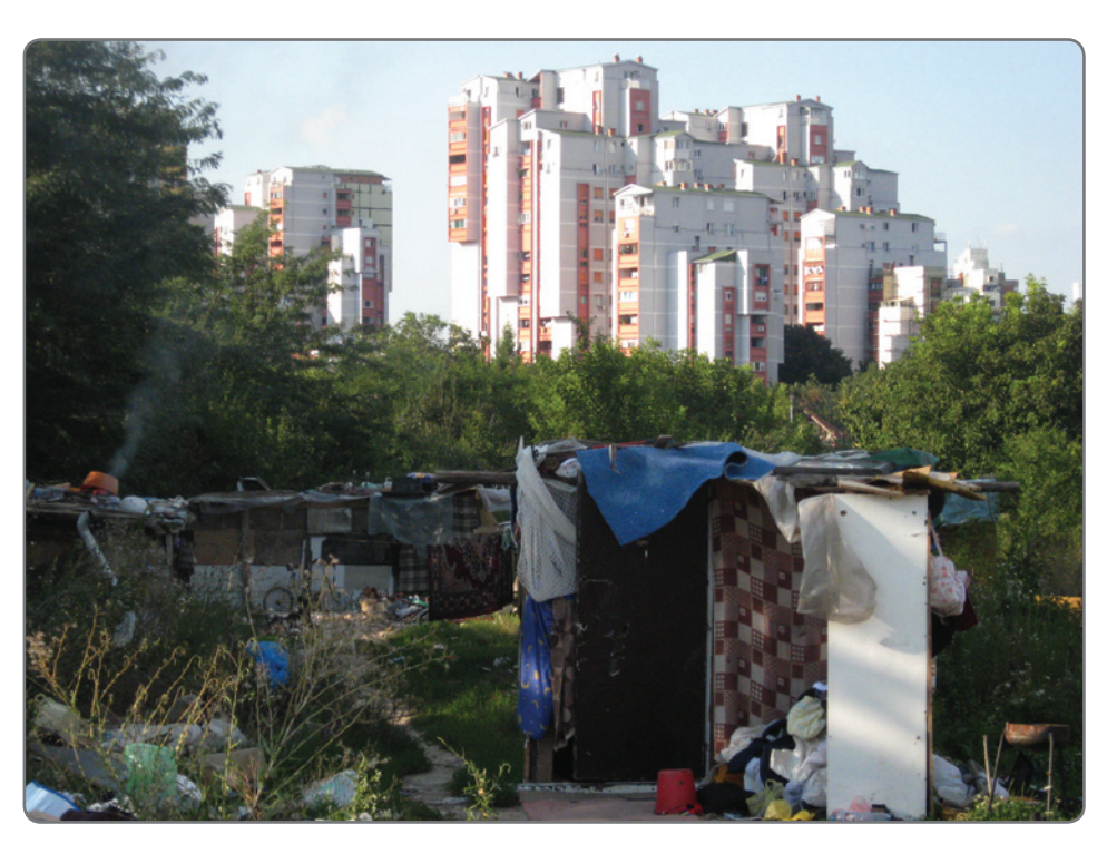
Improvised toilet in a Romani settlement in Vidikovac, Belgrade, Serbia. Residents of the settlements have been under the constant threat of eviction since Belgrade authorities announced that this settlement, located beside the Blok 67 settlement which was evicted in 2009, would be demolished in July 2010.

Housing is similarly inhabitable when it does not have proper sanitation. Yet, many Romani communities have no sewage system. The Romani neighbourhood in Durrës, Albania , for example, does not have anything resembling a sanitation system and toilets are simply holes in the yard. <sup>132</sup> These systems are often insufficient to deal with the volume of human waste created. Mr X.V., a resident of the village of Mbrostar-Ura in Fier, Albania explains that, "Our toilet is a hole behind