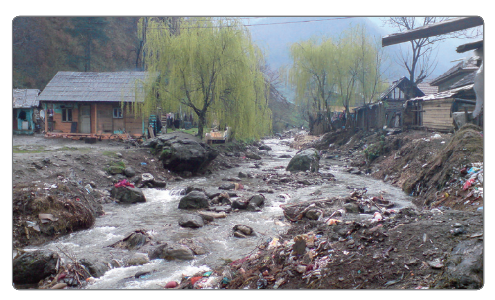
The river passes through the informal Valea lui Stan Romani community in Brezoi, Romania. During an ERRC visit in February 2010 residents reported that local authorities denied them the opportunity to improve their housing conditions by applying for social housing.

Solid waste collection continues to be underdeveloped or absent in many Romani communities. In the informal Romani community in Štip, Macedonia , local authorities do not collect garbage from the settlement. Residents therefore throw garbage into the street.<sup>129</sup> It is similar in the settlement at Stacioni I Trenit in Tirana, Albania , with very negative consequences. As one