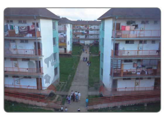
In 2001, rent paying Romani residents of Prešov, Slovakia, were forced to move into new social housing in Stará Teheľňa built by local authorities specifically for Roma.

Prešov was visited by the Deputy Minister of Social Affairs (in charge of Roma issues at the Ministry) who blamed human rights activists for calling the wall segregation and stated that it was not so bad. The Deputy Minister expressed concern about the fact that Roma now have to walk a longer distance to access the post office, school, kindergarten and other services they