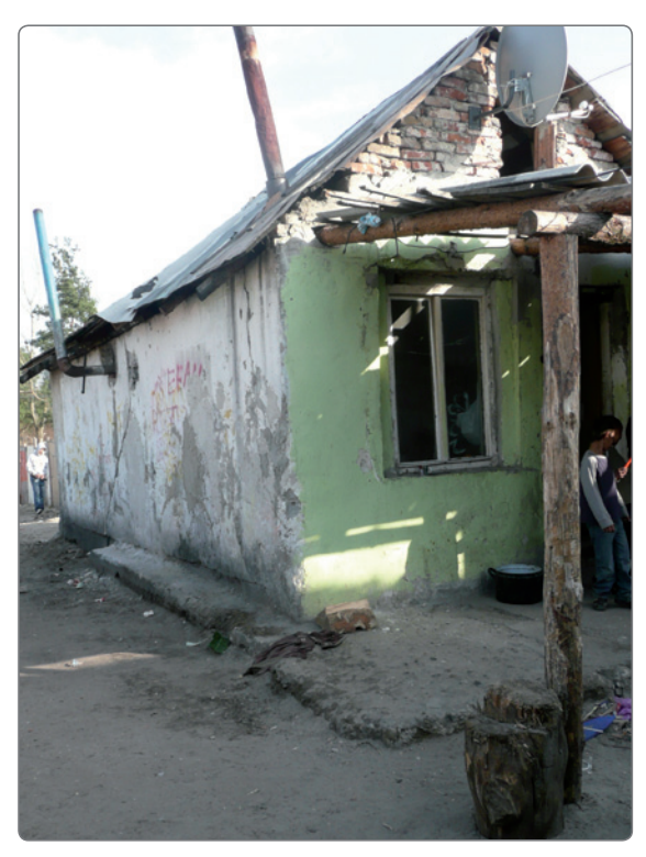
Since the autumn of 2009, local authorities have sought to evict around 700 residents of the informal Romani settlement in Plavecký Štvrtok, Slovakia, and demolish their homes without any plan for the relocation or re-housing of the community.

Around 700 Roma live in Plavecký Štvrtok, Slovakia ; 500 of whom are officially registered in the village. According to ERRC documentation, most of the Roma live in a segregated settlement, in informal houses which have been there for 50 years or more. The State owns most of the land on which the settlement is built. According to the urban plan, there are 90 houses in the settlement and none are registered. The settlement is located on protected land and there is a gas line under the area.