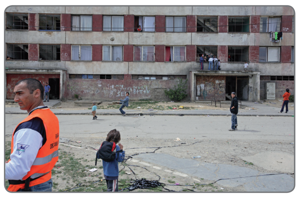
In 2004 local authorities in Košice, Slovakia, moved the last non-Romani residents out of the Luník IX housing estate, creating a segregated Romani ghetto which now stands in very dilapidated conditions.

From the perspective of segregation, in terms of physical distance between Romani and non-Romani dwellings out of 57 examined localities, in 39 cases (68%) the level of segregation was kept at the level before construction – the new construction was about the same distance from the non-Romani part of the municipality (or the municipality as such) compared to the original settlement. In 13 cases (23%) the new construction is even further removed in comparison to the original housing of the Roma. Only in 5 cases (9%) did the new construction reach its integration objective and bring the Romani and non-Romani dwellings closer to each other; while in 91% of the examined cases the declared objective – contribute to the integration of Roma by construction – was not achieved. 166