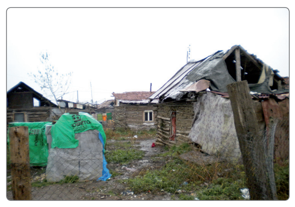
Roma living in segregated informal housing in Ostrovany, Slovakia, were subjected to degradation in October 2009 when the local authority used public funds to build a wall between them and the non-Romani residents of the village.

A number of proposals addressing alleged "Roma criminality" were initiated soon after the protest in Šarišské Michalàny. Increasing support for Marian Kotleba, the leader of the protest, was shown following the announcement of his candidacy for regional parliament in the Banská Bystrica region. The Conservative Democrats of Slovakia proposed publishing statistics on crimes perpetrated by Roma<sup>30</sup> and the Minister of Interior of the ruling party at the time, SMER, announced an increase in the number of police officers in Romani settlements.<sup>31</sup> During the regional elections in autumn 2009, Roma were notably present in campaigns, but the promotion of repressive measures against Roma did not significantly change before the parliamentary elections in the summer of 2010. The question of security and protection from "Roma criminality" remained in the public discourse, promoted not just by extremist parties but by mainstream political figures as well.