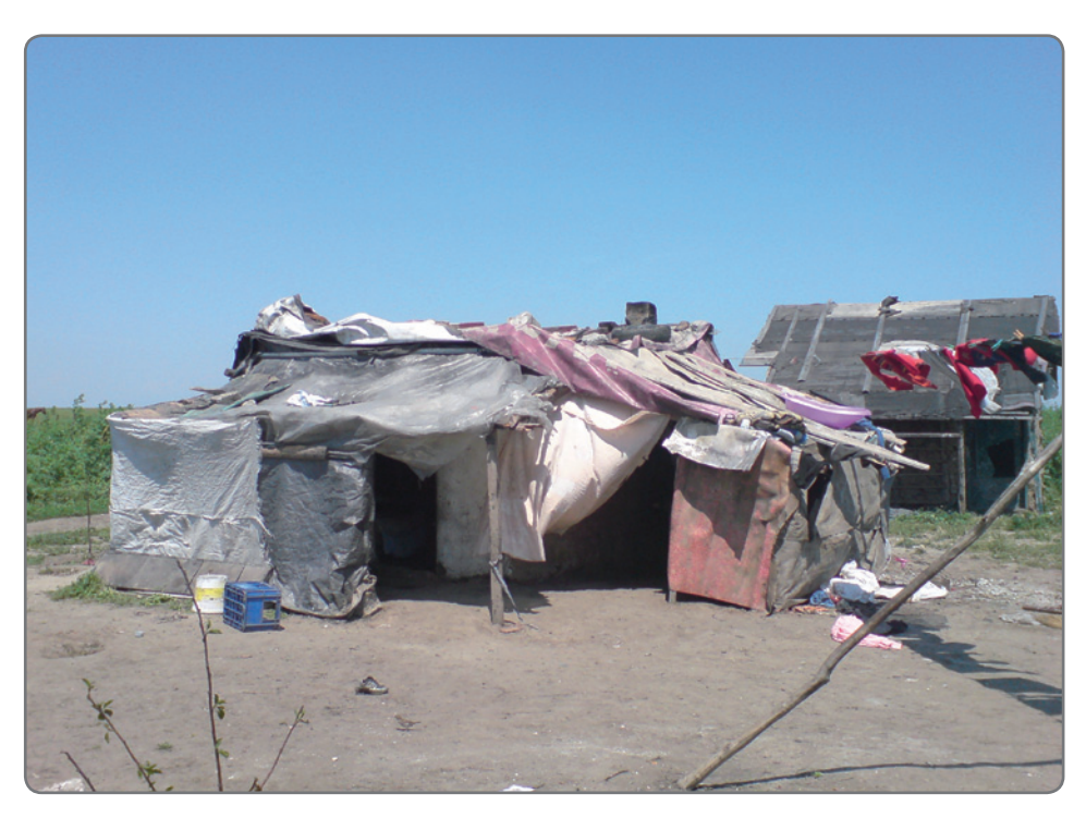
A 60-year-old Romani woman and four minors live in this shack located in the village of Dobreni's Romani settlement in Giurgiu County, Romania.

The housing conditions prevailing in many of the communities visited in this study were highly substandard. The housing of many Roma continues to be characterised by a lack of basic services and infrastructure, such as water, electricity, and sewage or garbage removal. Many Roma live in improvised homes built of collected wood, metal, cardboard and other materials which do not protect the residents against the elements. Some communities are located next to garbage dumps or other hazardous areas, posing health threats to the people living in the communities. The roads in these communities are often unpaved and can be