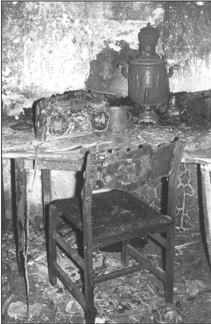
The Fedorchenko home, following firebombing in October 2001. The case is currently pending at the European Court of Human Rights.