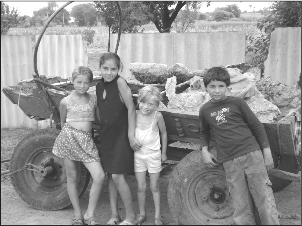
Children in front of wagon with scrap metal, Pishanko, Dnipropetrovsk Region, August 2006.