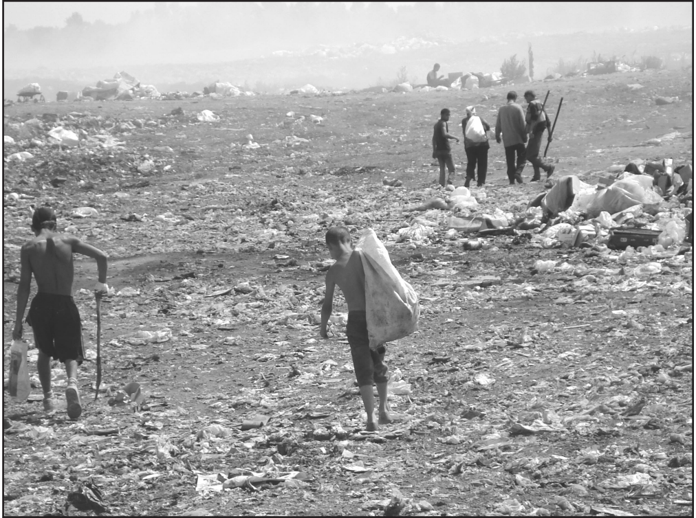
Scrap metal and glass collectors at the Novomoskovsk municipal dump, August 2006.