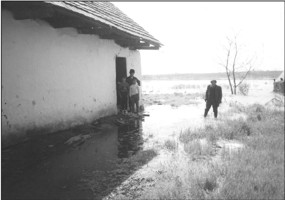
Roma in the village of Jesenj, Uzhgorod Province of Western Ukraine.