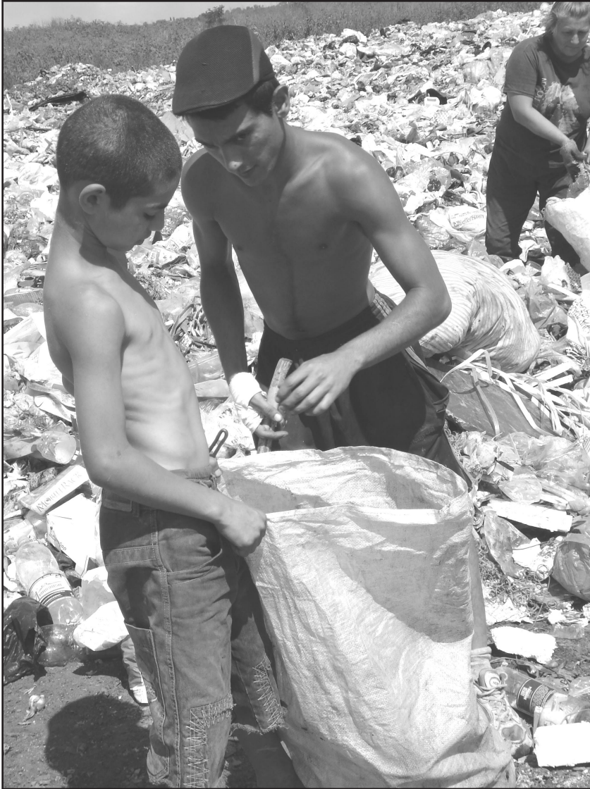
Young Romani boys collecting scrap metal and glass at the Novomoskovsk municipal dump.