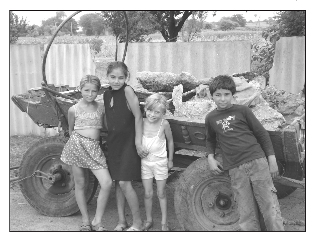
Children in front of wagon with scrap metal, Pishanko, Dnipropetrovsk Region, August 2006.