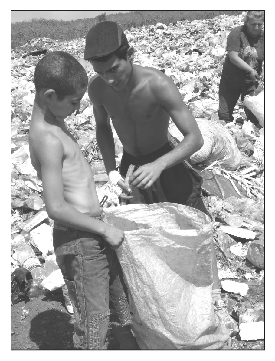
Young Romani boys collecting scrap metal and glass at the Novomoskovsk municipal dump.