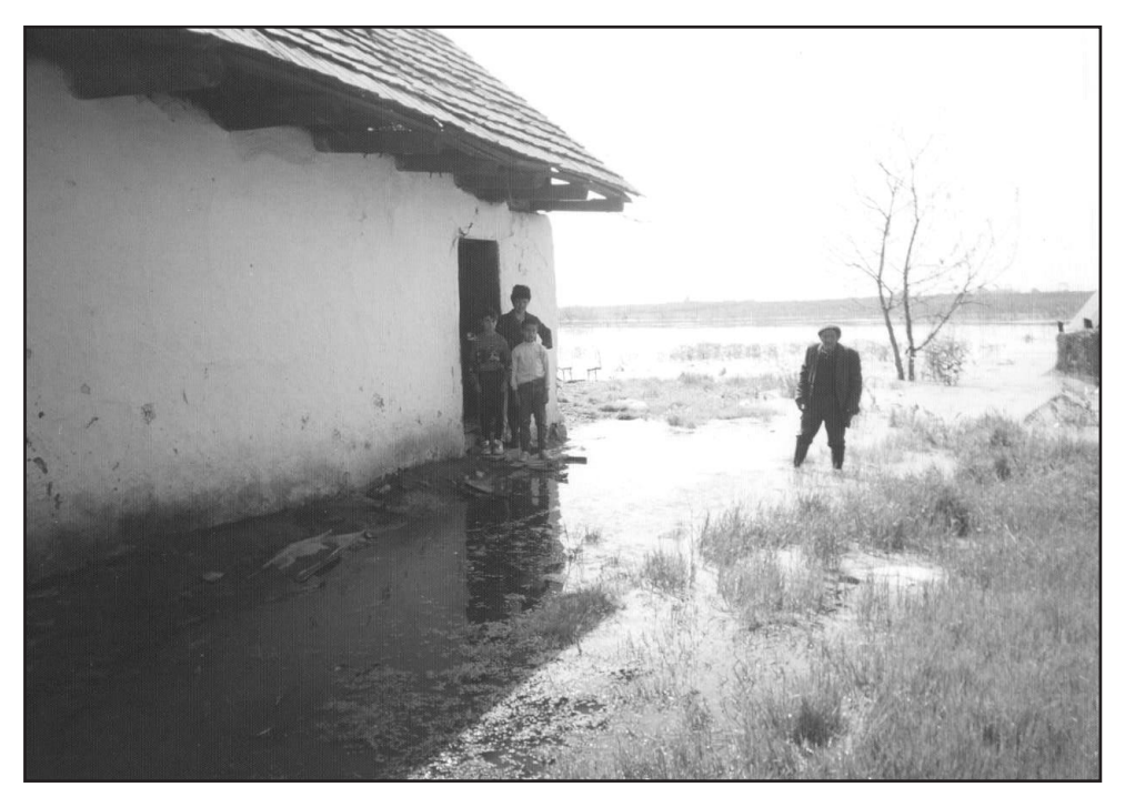
Roma in the village of Jesenj, Uzhgorod Province of Western Ukraine.