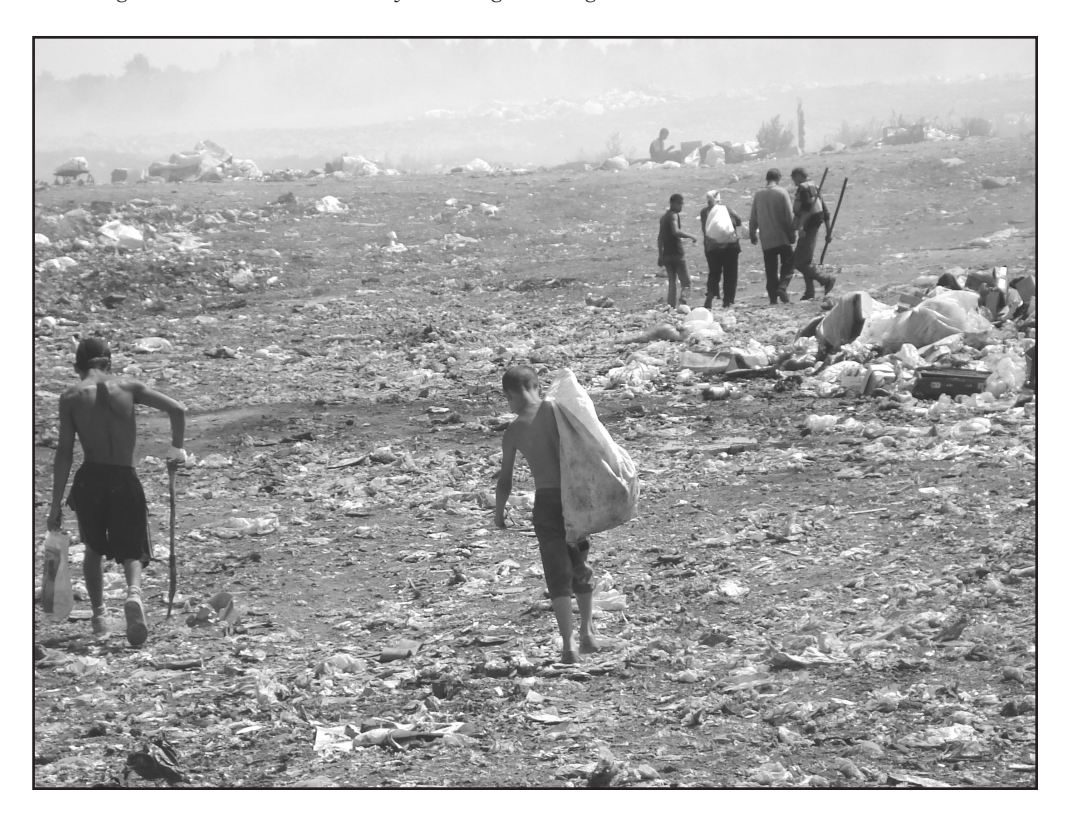
Scrap metal and glass collectors at the Novomoskovsk municipal dump, August 2006.