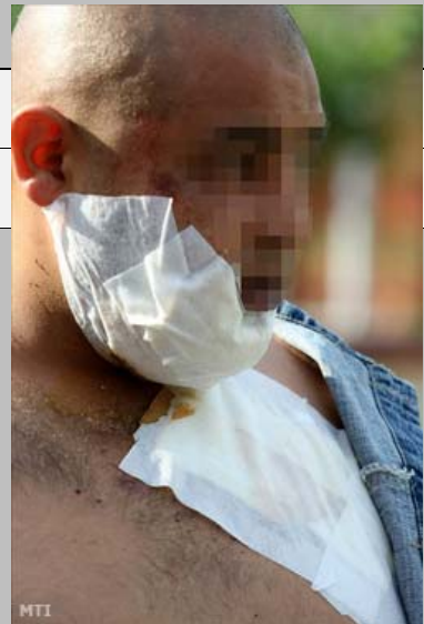
one of the victims

The aggressor was known for making harassing statements towards Roma and for connections to the Magyar Garda, whose press-office denounced this attack.