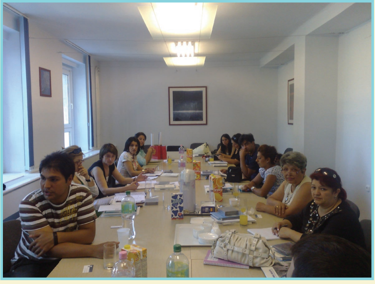
sues such as the Roma ERRC organised a series of meetings with relevant stakeholders working Education Fund, Roma- on Romani issues for the group of Romani women from Serbia, Croatia, Montenegro and Bosnia and Herzegovina visiting Budapest on a study trip.

In addition to the meetings, the ERRC conducted a workshop which addressed the fundamental distinctions in terms of approaches to Roma rights advocacy and activism, discussing the major differences between the "rights-based" and the "needs-based" approaches to ad-