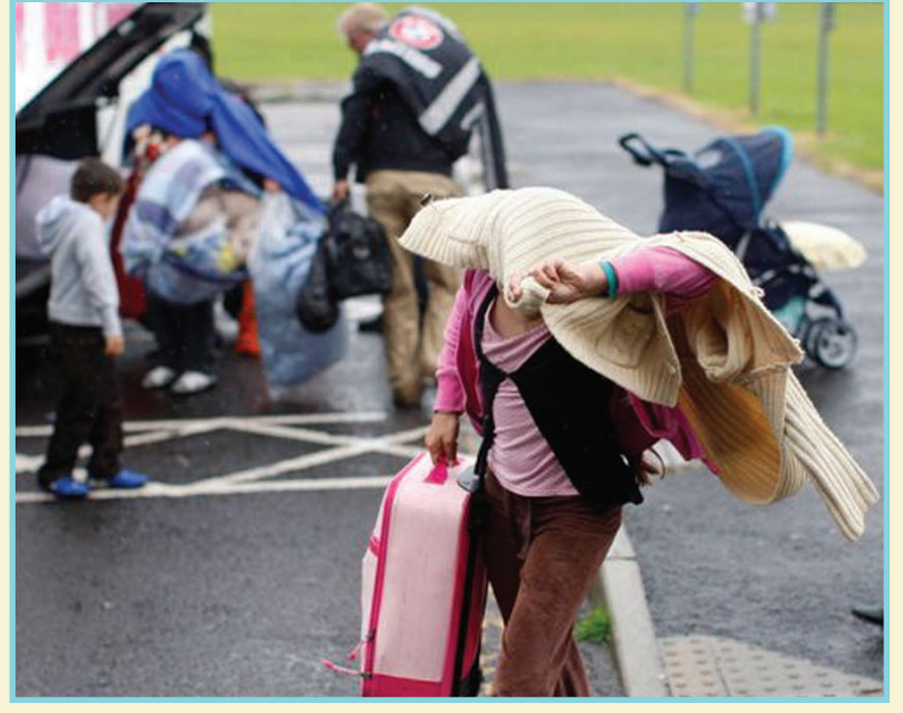
More than 100 Romanian Roma left Northern Ireland after violent attacks on their homes in Belfast which started on 12 June.

After several days of wide media coverage of the incidents, the Northern Ireland's Social Development Ministry decided to pay the costs of the Romani families' return to Romania.